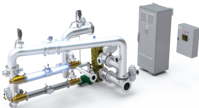
BIO-SEA B02-0300 modular retrofit installation